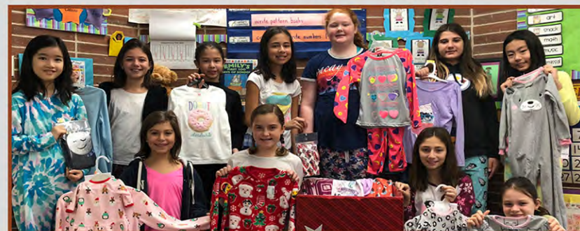
Harrison Avenue Elementary