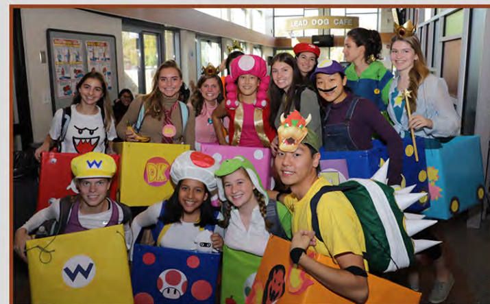
Harrison High School