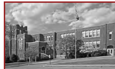
Samuel J. Preston School 50 Taylor Avenue West Harrison, NY 10604