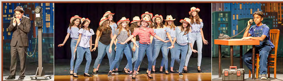
Louis M. Klein Middle School