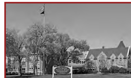
Parsons Memorial School 200 Halstead Avenue Harrison, NY 10528