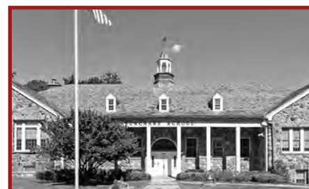
Purchase Elementary School 2995 Purchase Street Purchase, NY 10577