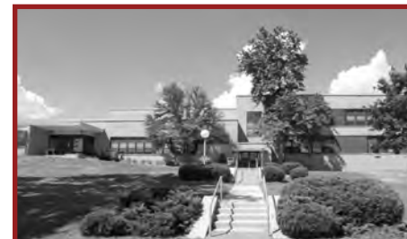
Louis M. Klein Middle School 50 Union Avenue Harrison, NY 10528