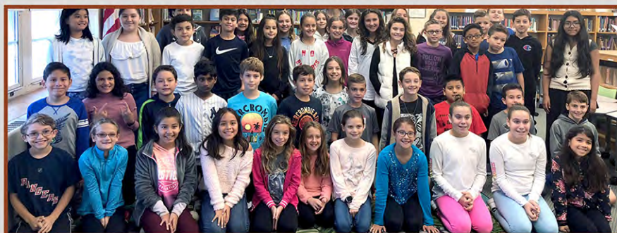
Samuel J. Preston Elementary