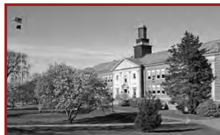
Harrison Avenue School 480 Harrison Avenue Harrison, NY 10528